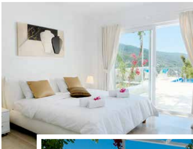
This hidden retreat is perfect for romance

interior is fab too, with white-as-a-cloud decor that adds to the sense of lofty tranquillity. THE LOCATION Islamlar village is a traditional place – you'll love sipping sweet dark tea at the old teahouse and buying your loaves at a bakery that grinds its own flour. Shepherds tend their flocks by vertiginous walking trails, and the Lycian Way is on hand for a serious hike in refreshing mountain air. THE FOOD Trout is the local speciality – sample it at easy-going Mahmut's in the village. Or drive down to Kalkan, where a zillion rooftop restaurants offer everything from mezze to Mexican. THE COST From £811pp for seven nights in April, the start of the season, including flights and car hire; simpsonstravel.com. Find out more at gototurkey.co.uk.