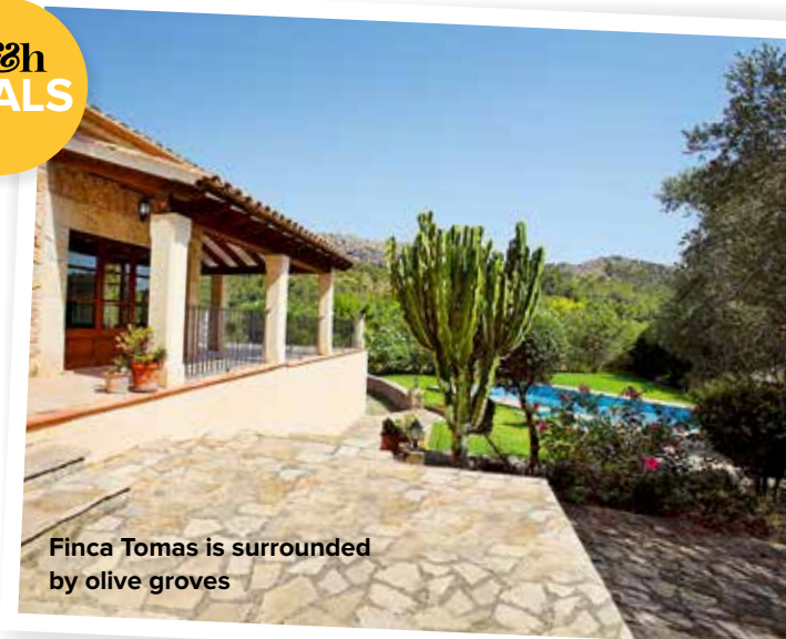
Finca Tomas is surrounded by olive groves