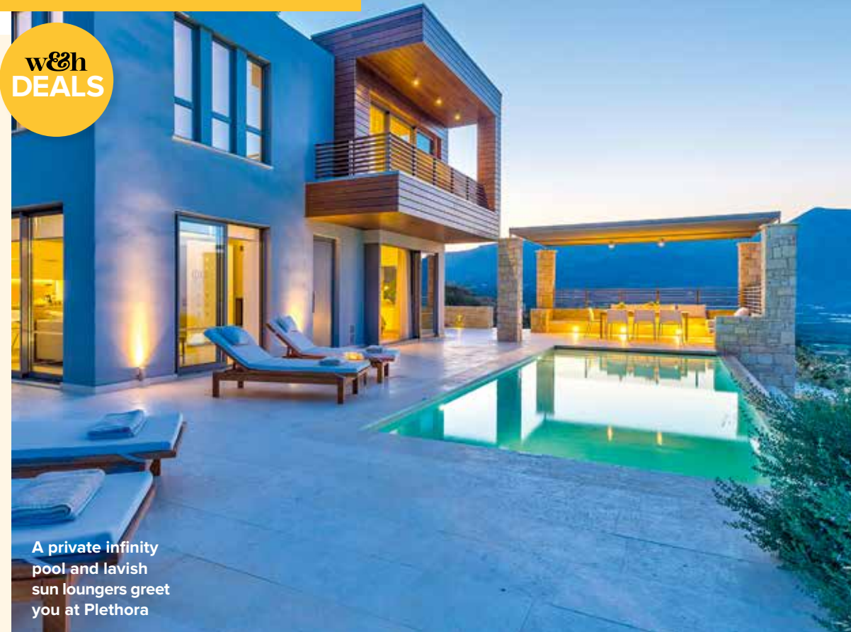
A private infinity pool and lavish sun loungers greet you at Plethora

THE VILLA Looking over olive groves to the coast, Youphoria Villas are a collection of six designer hideaways near the north-western harbour town of Kissamos on Greece's largest island. We love open-plan Plethora (sleeping five). Its two bedrooms have extravagant en suite bathrooms and a sea-view balcony. THE LOCATION This is Crete's most unspoiled corner, with secluded peninsulas and traditional villages to explore. Take a boat from Kissamos to gorgeous Balos beach, where a turquoise lagoon edged by white sand is warm enough for swimming from May. THE FOOD A night at Gramboussa Taverna in Kalyviani is film-set Greece – you'll be surrounded by vivacious, laughing families and eat delicious dishes like stuffed courgette blossom and rabbit wrapped in lemon leaves. THE COST Plethora costs from £234 per night; youphoriavillascrete.com. See easyjet.com for flights and car hire, and visitgreece.gr for more information.